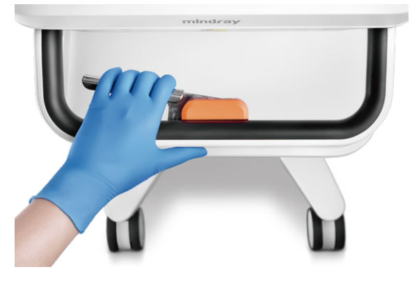
An innovative auto handle brake system is available to ensure safe and seamless transfers